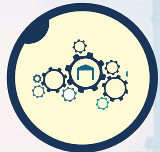
Supply Chain and Logistics Session