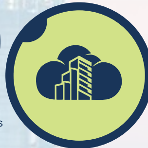
BIM And Digital Construction Session