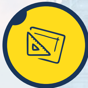
Architecture Design Innovations Session