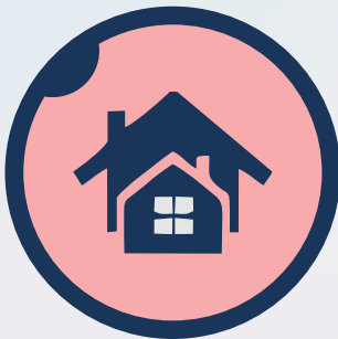
Real Estate Revolution Session