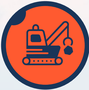
Building Machines Innovation Session

The conference and masterclass will consist of 8 plenary sessions which include the following;