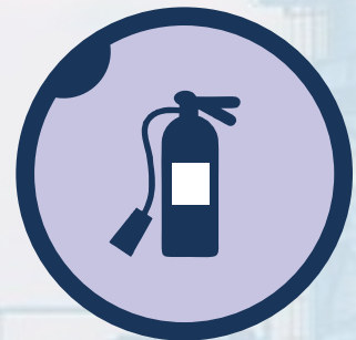
Fire Safety and Protection Session