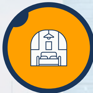
Building Interior Innovation Session